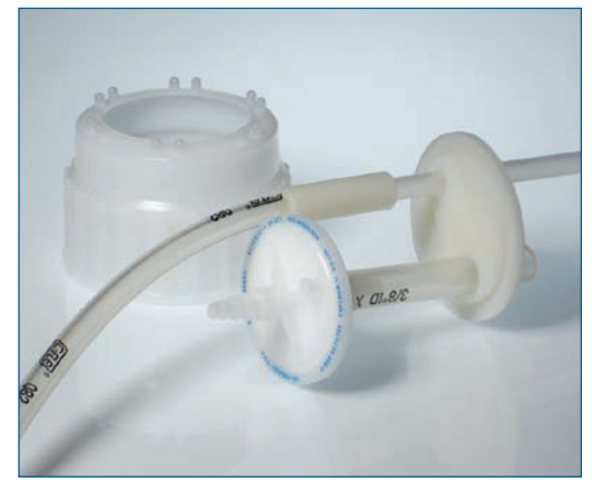
EZ Top<sup>®</sup> Assembly and cap