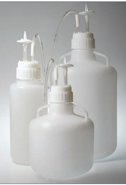
Bio-Simplex<sup>™</sup> Container Closure System featuring the EZ Top<sup>®</sup> Assembly and cap.

Custom designs, materials, sizes, packaging and other options—such as quick disconnect devices, Luer connections, heat-sealed ends or alternate carboy materials—are available on request.