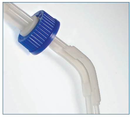
Spinner Flask Closure Assembly and cap. Cap colors may vary.