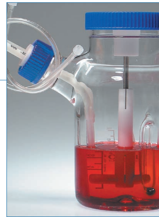
Bio-Simplex<sup>™</sup> Spinner Flask Accessories feature the EZ Top<sup>®</sup> Assembly and cap. Glassware shown is representational of final usage and not included in assembly.

For more detailed specs on Bio-Simplex<sup>™</sup> Spinner Flask Accessories, please see our product spec sheets.