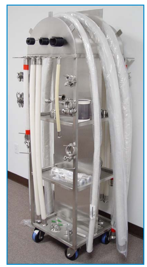
Custom Units Built to Order