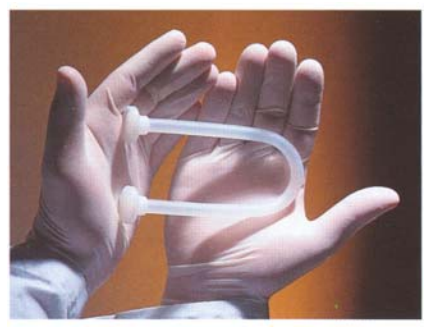
The tubing is ready to be connected to Sani-Tech flexible or rigid sanitary systems.