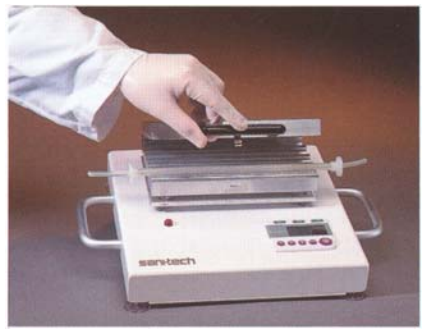
Place the tubing into the heater block.