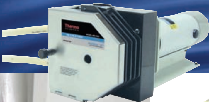
Metering system 960-2010 includes a High-Performance pump head