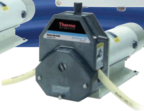
Metering system 950-2010 includes an Easy-Load® pump head