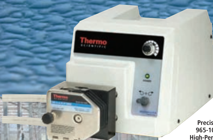
Precision standard drive 955-1000 with Easy-Load® II pump head