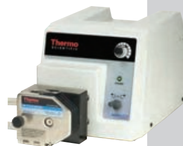
High-Pressure pump system 970-1500